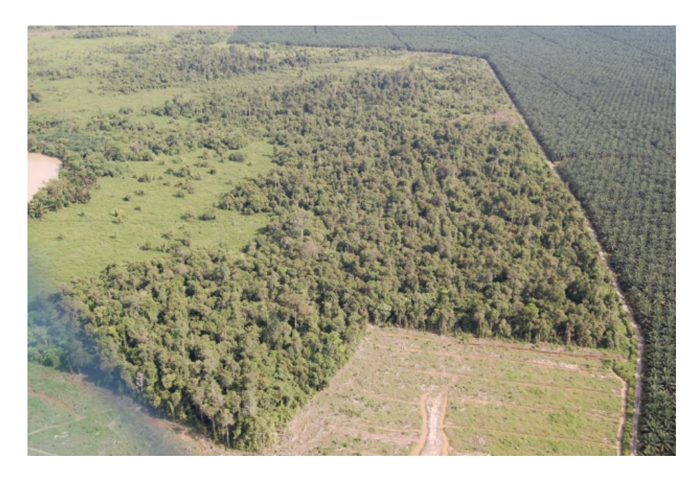
An aerial view of palm plantations, right, beside forest in Borneo. The island's forest cover has decreased dramatically since the mid-1980s. (Marc Ancrenaz)

cause widespread crop damage as they have only one mouth to feed.