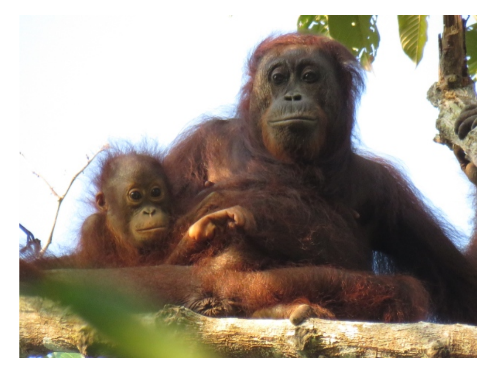
A Bornean orangutan sits with her baby. Researchers fear the species, found only on Borneo, could be extinct within the next couple decades.